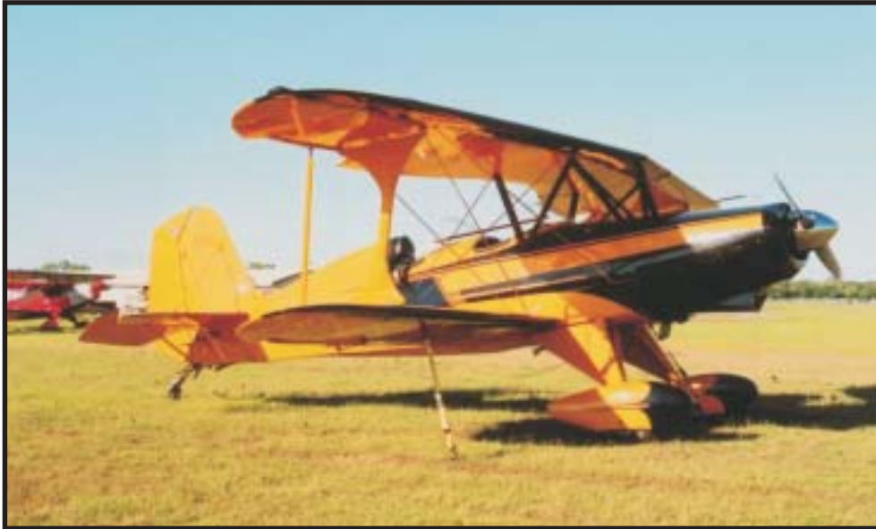
Experimentals such as this gorgeous Starduster Too abound at Bartlesville.