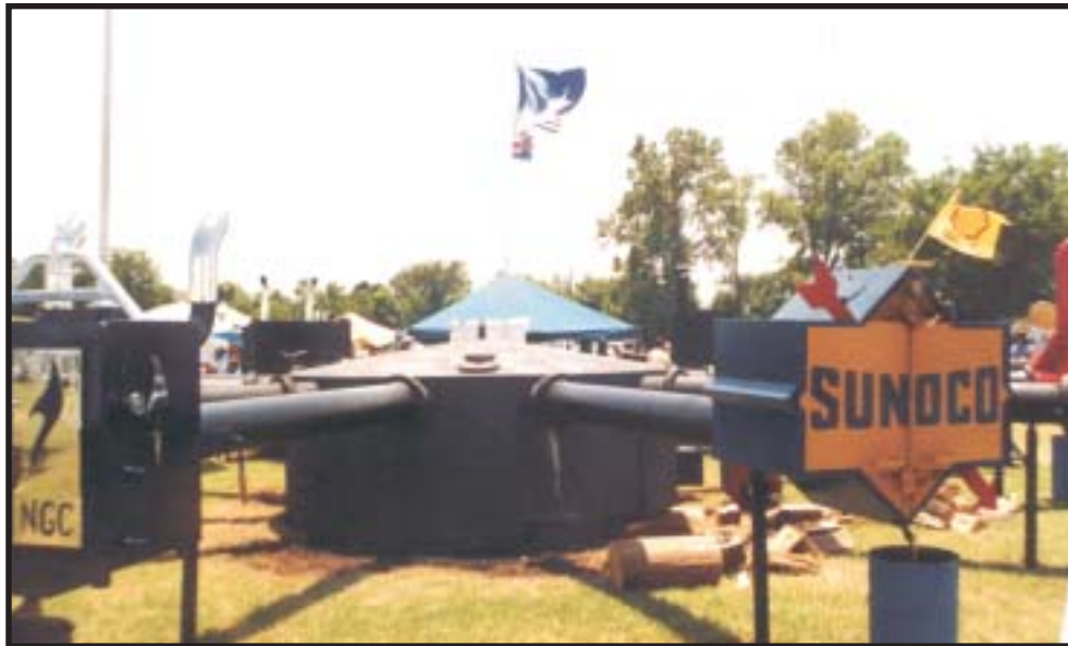
"World's Largest Smoker," symbolizing Cushing's oil transportation industry.