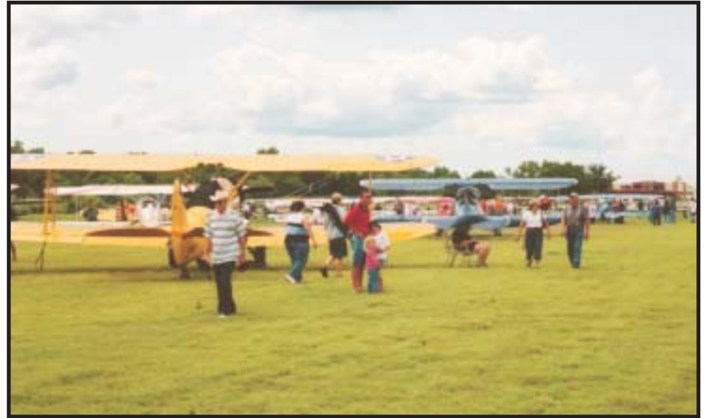
Visitors get the opportunity for up-close views of the biplanes at Bartlesville.